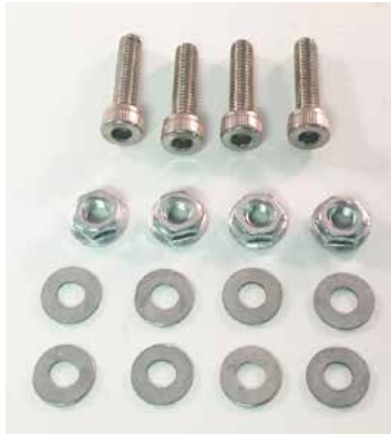
Fog Light Hardware

3101 W. FM 544 Wylie, TX 75098 866.342.0977 BLKMTNJeep.com